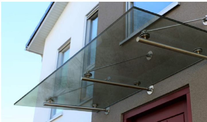
Fig. 2 Traditionally laminated flat glass

The figures below show glass canopies exposed to weather conditions.